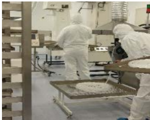
Med Tec Bio Pharma Clean Room Molding & Assembly

Precision Molding, Extrusion and Assembly for Medical Devices and Bio Pharma