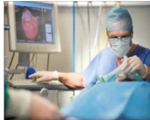
Medical & Surgical Device