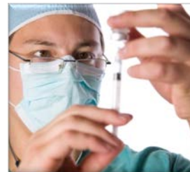
Fluid Management & Catheterization