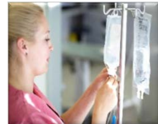
Drug Research & Drug Delivery